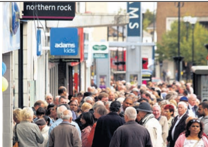
Customers stand in a queue outside a branch of the Northern Rock, the British mortgage lender, in Harrow, London, on Monday Sept. 17, 2007.

Q T Q D A Q. — C S B D Y X N S D Q B J Yesterday's Cryptoquote: ONE DAY I WILL FIND THE RIGHT WORDS, AND THEY WILL BE SIMPLE. — JACK KEROUAC